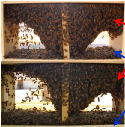
Acceptable and non-replaceable

The photos at left below show packages with a normal amount of dead bees (less than 1½"), which is not replaceable. The photos at right show packages in which there is a level of dead bees that would warrant replacement.